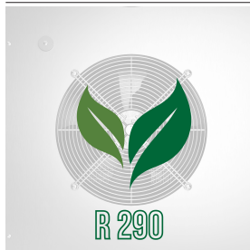
Ecological gas (R290)