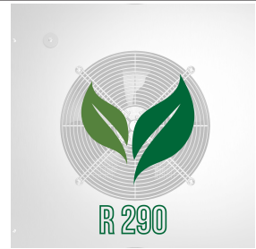
Ecological gas (R290)