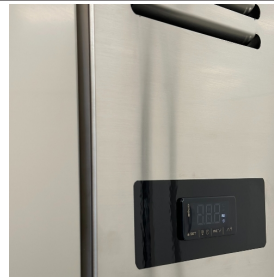
Digital control with temperature +2/+10 °C.