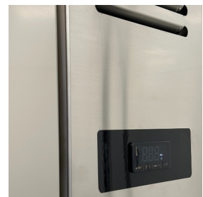
Digital control with temperature +2/+10 °C.