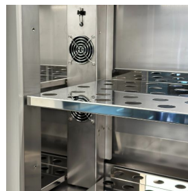
Perforated internal shelves 35.7x34 cm.