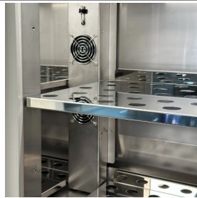
Perforated internal shelves 35.7x34 cm.