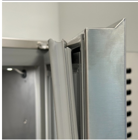
Insulation thickness 50mm and easily removable gaskets.