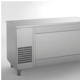
S/S back finish