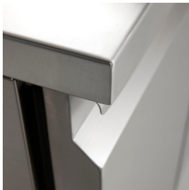
Stainless steel construction with 50mm insulation thickness.