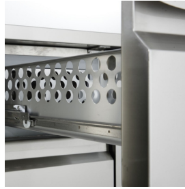
Drawer unit detail.