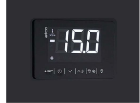
Digital touch thermostat