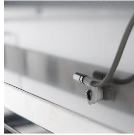
Internal cell probe for constant temperature monitoring