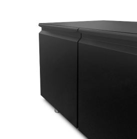
Color finish (RAL) upon request