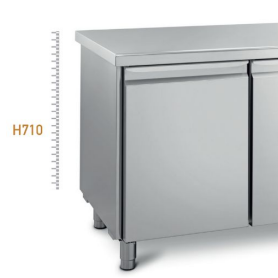
body h 710 mm