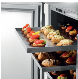
40x60 cm trays