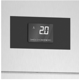
Constant temperature monitoring with digital control board