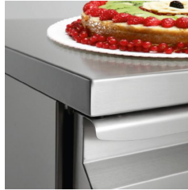
Worktops in stainless steel, height 40 mm, reinforced and made from 15/10 thick sheet metal