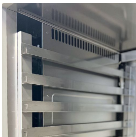
Automatic condensate water evaporation