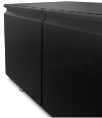
Color finish (RAL) upon request