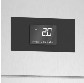
Constant temperature monitoring with digital control board