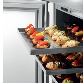
40x60 cm trays