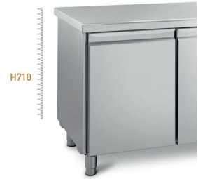
body h 710 mm