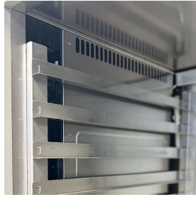
Automatic condensate water evaporation