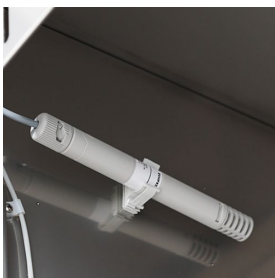
Internal room humidity control kit with electronic probe for detecting relative humidity