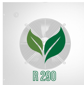
Ecological gas (R290)