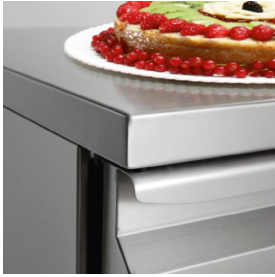
Worktops in stainless steel, height 40 mm, reinforced and made from 15/10 thick sheet metal