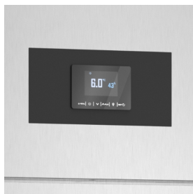
Control electronic board for the constant management of temperature and relative humidity