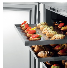
40x60 cm trays