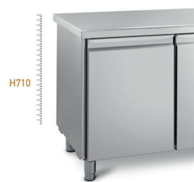
body h 710 mm