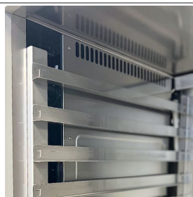
Automatic condensate water evaporation