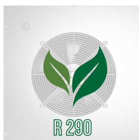
Ecological gas (R290)