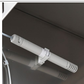
Internal room humidity control kit with electronic probe for detecting relative humidity