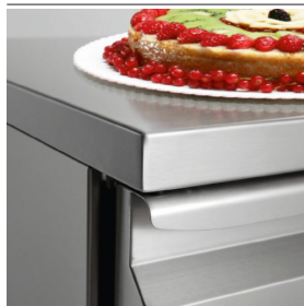
Worktops in stainless steel, height 40 mm, reinforced and made from 15/10 thick sheet metal