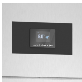
Control electronic board for the constant management of temperature and relative humidity