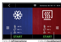
Manual work cycle