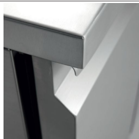
The stainless steel h 40 mm worktops are reinforced and made with 15/10 sheet metal