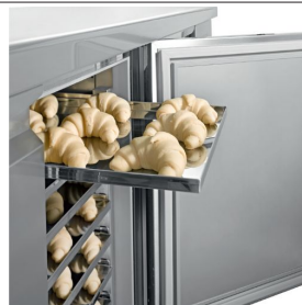
Stainless steel cm 40x60 tray