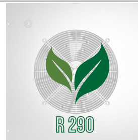
Ecological gas (R290)