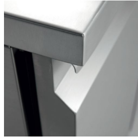
The stainless steel h 40 mm worktops are reinforced and made with 15/10 sheet metal