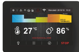
5" TOUCH electronic board