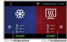
Manual work cycle