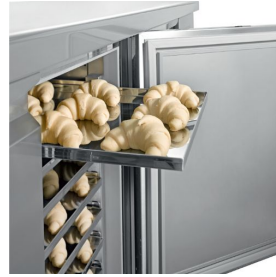
Stainless steel cm 40x60 tray