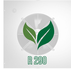
Ecological gas (R290)