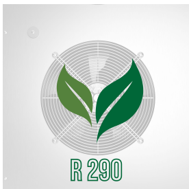
Ecological gas (R290)