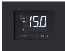
Digital touch thermostat