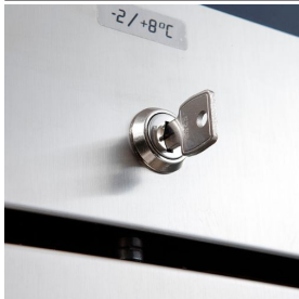
Door lock with key