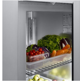
Internal capacity GN 2/1