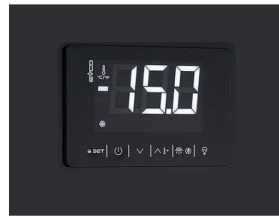
Digital touch thermostat