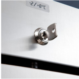
Door lock with key