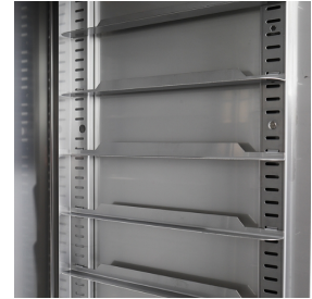
65mm pitch, 19 positions