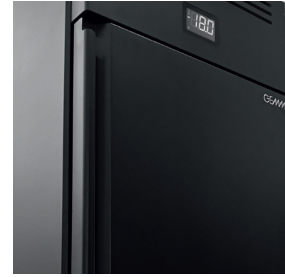
Custom color finish available on request