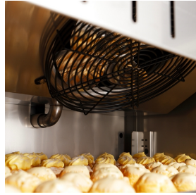
Evaporators with cataphoresis treatment and electronic fans