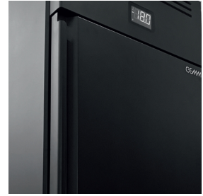
Custom color finish available on request