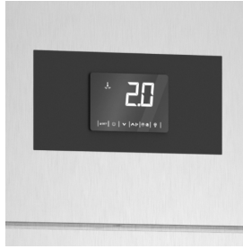
Constant temperature monitoring with digital control board