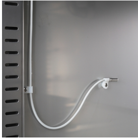
Internal cell probe for constant temperature monitoring