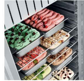
Total internal capacity of 54 ice cream containers of 5 liters each