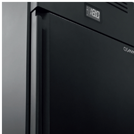
Custom color finish available on request