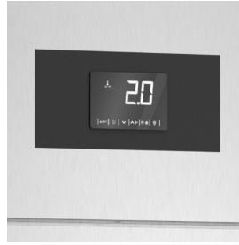
Constant temperature monitoring with digital control board