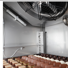
Electronic probe for relative humidity detection