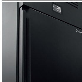
Custom color finish available on request