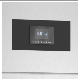
Control electronic board for the constant management of temperature and relative humidity