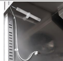
Humidity control with electronic probe