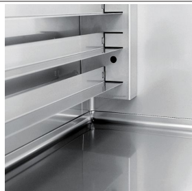
Racks with easily removable runners with 74 positions (16.5 mm pitch)