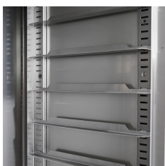
Racks with easily removable runners with 74 positions (16.5 mm pitch)