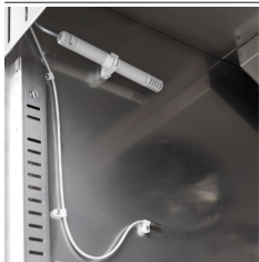
Humidity control with electronic probe