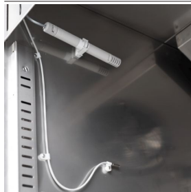
Humidity control with electronic probe