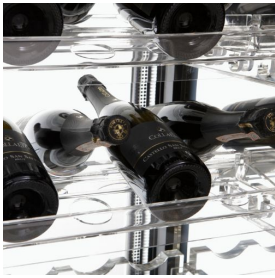
SI5/04 Inclined bottle shelf in plexiglas