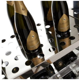
SR5/01 perforated stainless steel panel, no. bottles capacity