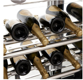
SC5/03 Flat bottle structure in plexiglas