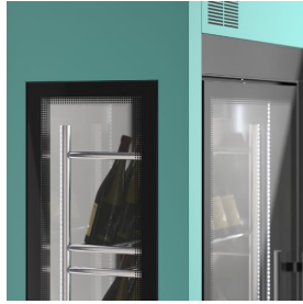
Custom color finishing (on request)