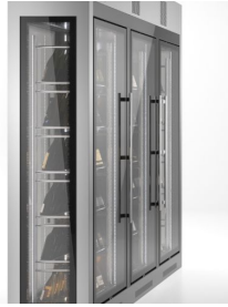
Glass sides (upon request)