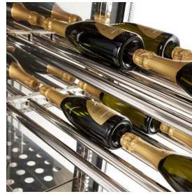
ST5/02 Stainless steel tube structure