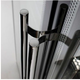
Stainless steel door handle detail