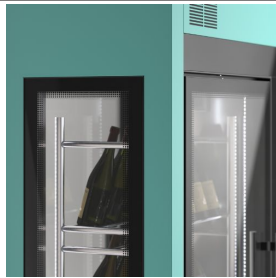
Custom color finishing (on request)