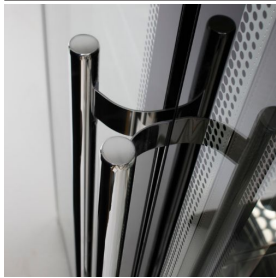
Stainless steel door handle detail