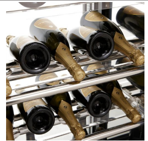
SC5/03 Flat bottle structure in plexiglas