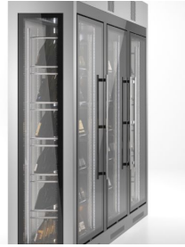
Glass sides (upon request)