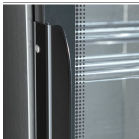
Color finishing (on request)