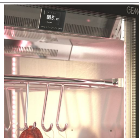
Stainless steel hanging rods for charcuterie