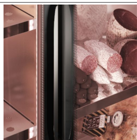
Perforated stainless steel shelf