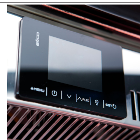
Digital touch display